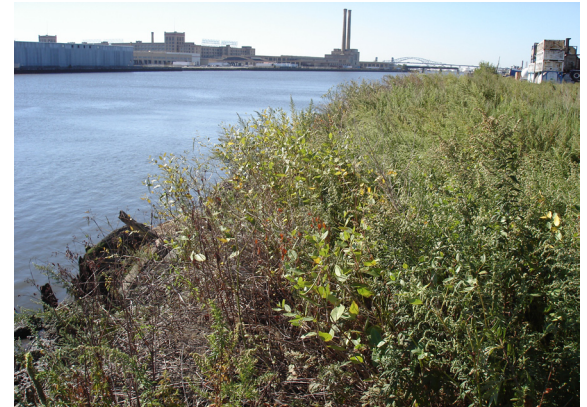
View of the Passaic River from the project site.

In accordance with N.J.A.C. 7:7E (NJDEP's Coastal Zone Management Rules), SAI prepared the NJDEP Waterfront Development permit as well as the applicable USACOE wetlands permits. As part of the application process, SAI prepared the environmental compliance statement supporting these applications, detailing technical compliance with the Coastal Zone Management Rules. The environmental compliance statement included an analysis of and protection for various environmental resources, such as finfish migratory pathways, navigation channels, flood hazard areas, wetlands, wetland buffers, riparian zones, and historic and archaeological resources. SAI also assisted Disch with the preparation of an alternatives analysis for the proposed mooring and pier installation project.